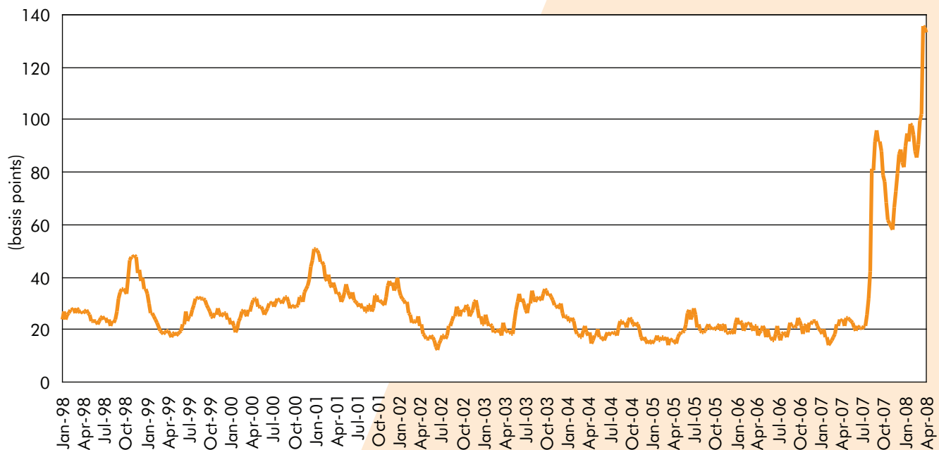
Exhibit 1: Jumbo-Conforming Spread (between 01/02/98 and 04/11/08)

wake of the challenging mortgage market environment of late 2007 and early 2008, the spread between jumbo and conforming mortgage rates widened significantly to above 100 basis points, as shown in Exhibit 1 . In this environment, homeowners in high-cost geographic areas were adversely affected by relatively high mortgage rates, making it more costly for home buyers and those wanting to refinance existing mortgages. Legislators are hopeful that the temporary increase in conforming loan limits will promote better liquidity in the primary mortgage market in high-cost geographical areas and extend the reach of lower conforming mortgage rates to high-cost geographic areas where borrowers have previously been required to obtain relatively higher-cost, non-conforming loans.